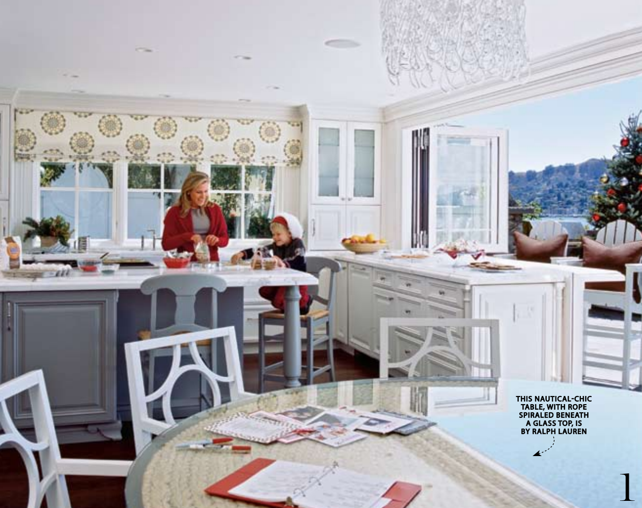
THIS NAUTICAL-CHIC TABLE, WITH ROPE SPIRALED BENEATH A GLASS TOP, IS BY RALPH LAUREN