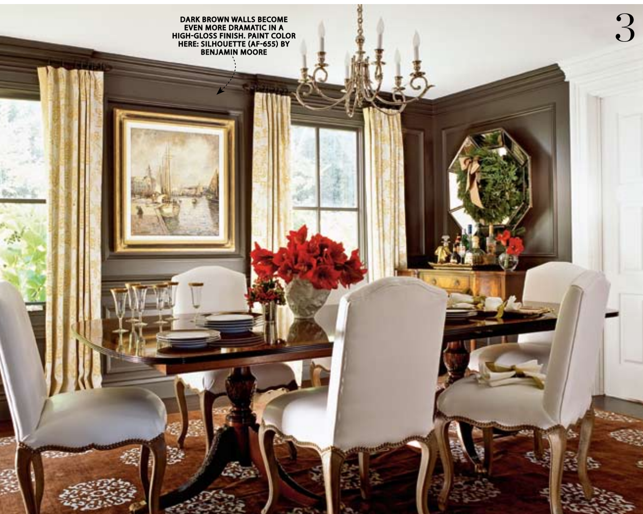
DARK BROWN WALLS BECOME EVEN MORE DRAMATIC IN A HIGH-GLOSS FINISH. PAINT COLOR HERE: SILHOUETTE (AF-655) BY BENJAMIN MOORE