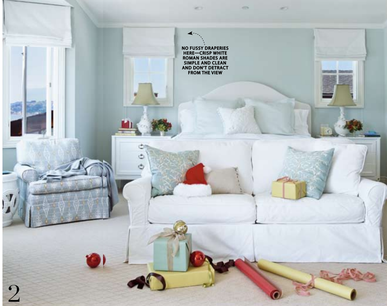
NO FUSSY DRAPERIES HERE—CRISP WHITE ROMAN SHADES ARE SIMPLE AND CLEAN AND DON'T DETRACT FROM THE VIEW