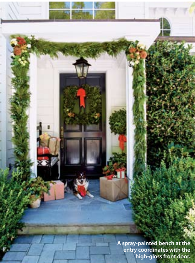
A spray-painted bench at the entry coordinates with the high-gloss front door.